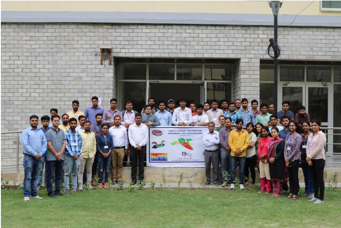
Picture 1: Group photograph of the participants and organizers at IIT Mandi, Kamand Campus