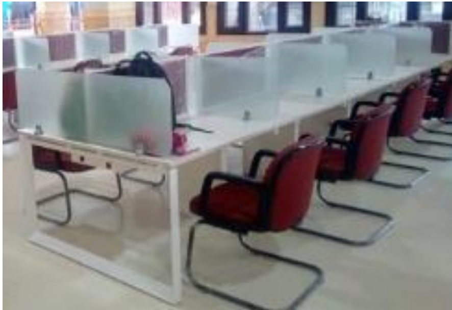
Photo : Workstation for reference only