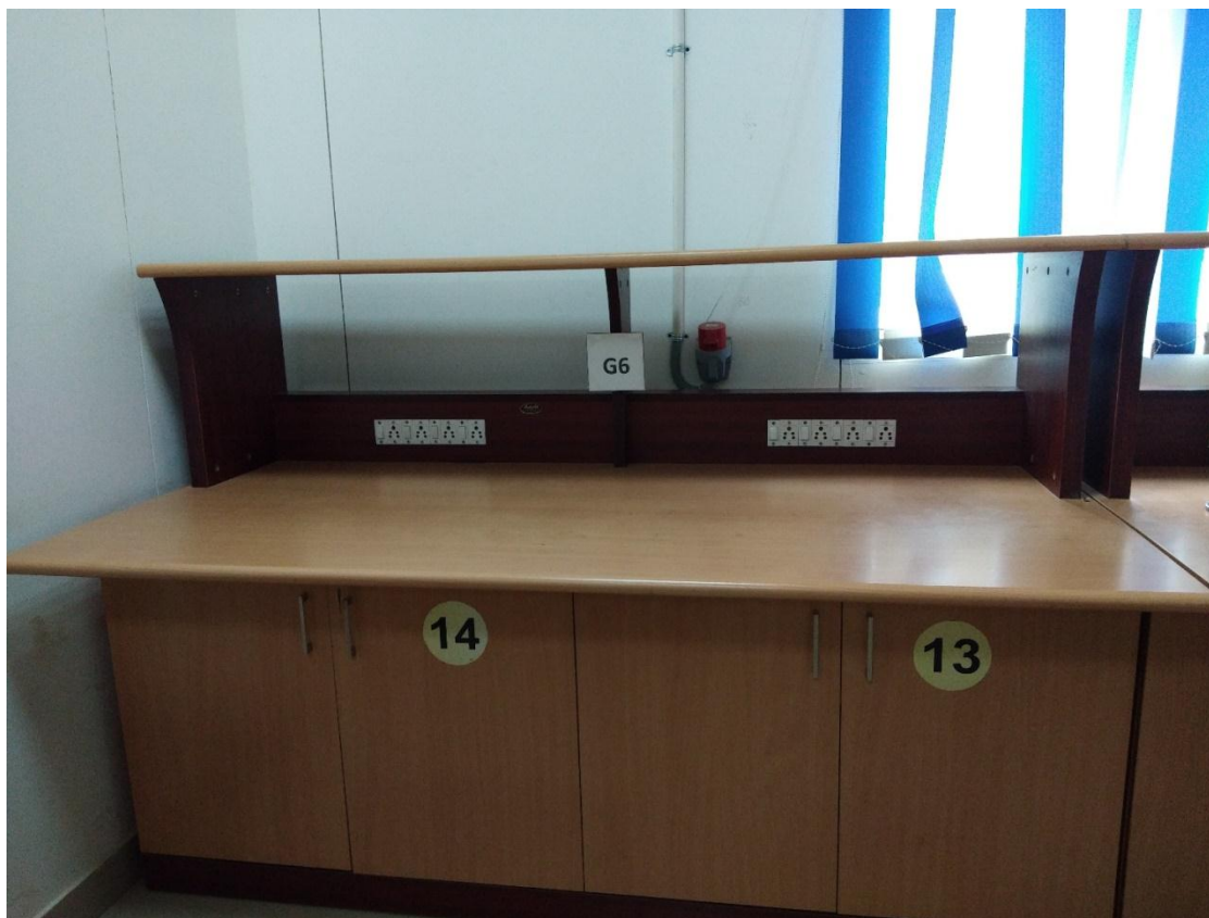
Modular Laboratory Table Sr. No.2 of tender specification (Photo is for reference only)

The last date & Time of receipt of quotations is 13 th August, 2019 till 02:00 P.M.