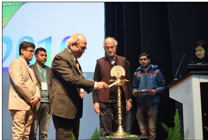
Lighting of Lamp by IndACM founding president