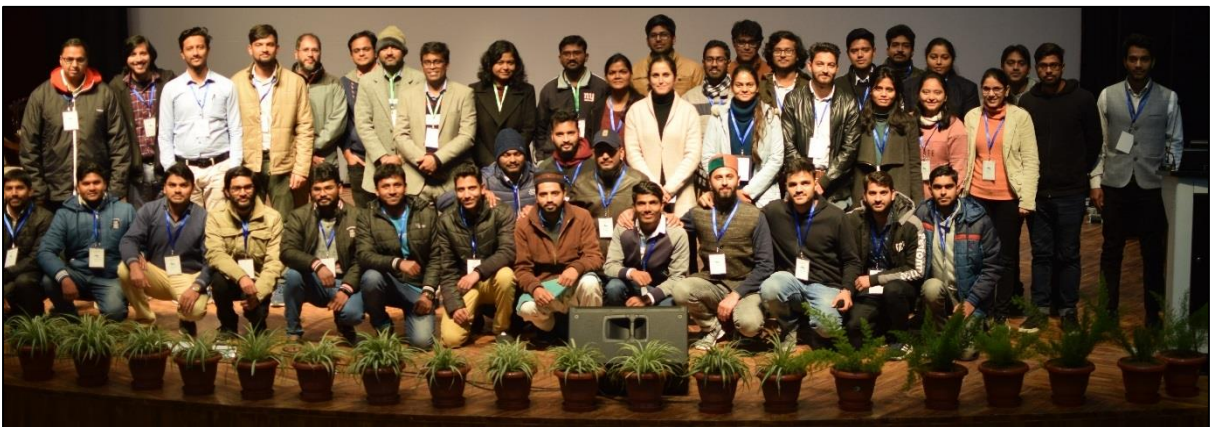
Organizing Team with Student Volunteers