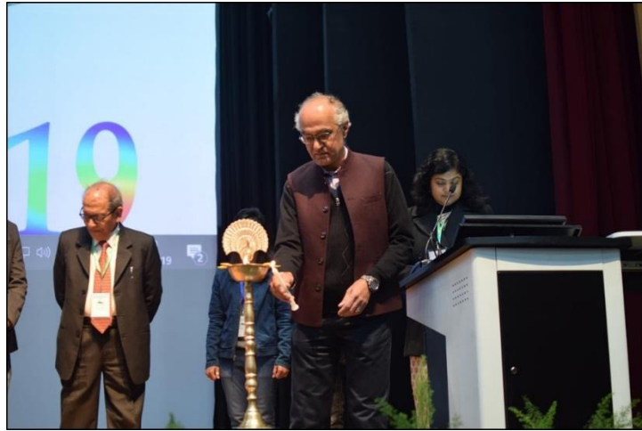
Inauguration by the Director, IIT Mandi