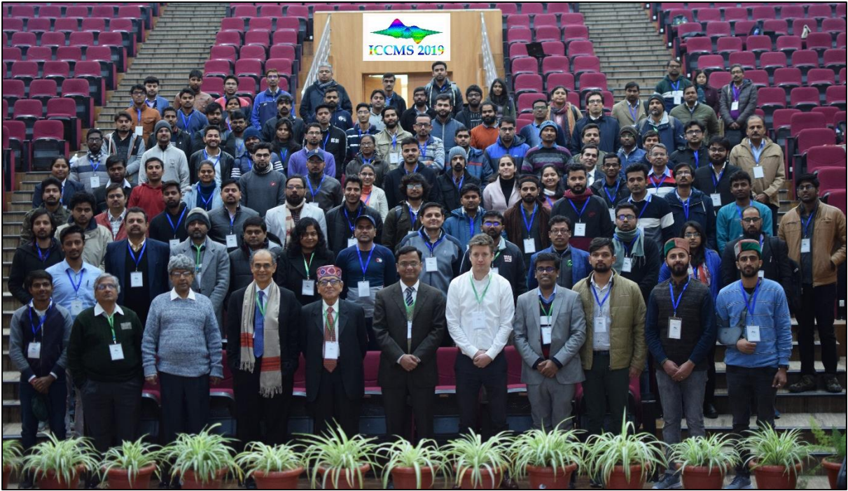
Participants on Day 3