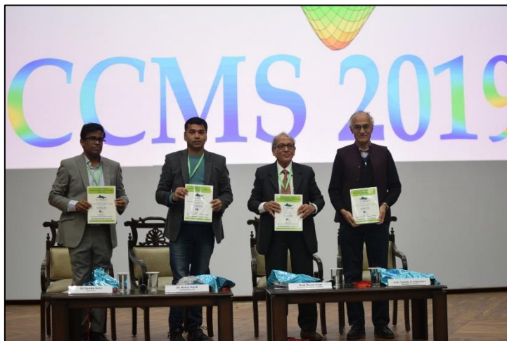
Publishing of Extended Abstract Volume