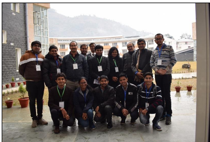
ISSMGE Mini-Symposium Participants